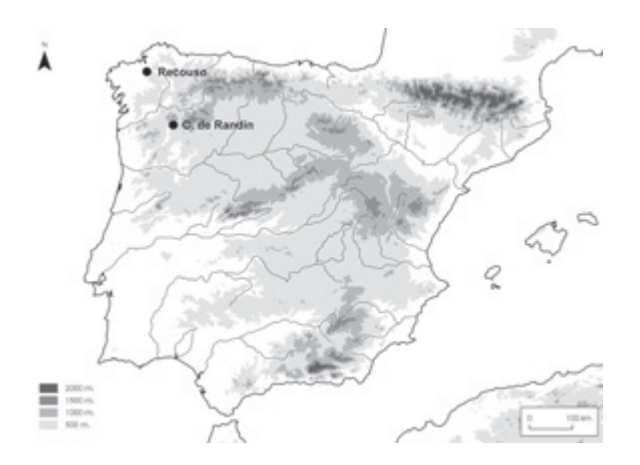
Fig. 1. Map of the Iberian Peninsula with the location of the sites where the dated objects were found.