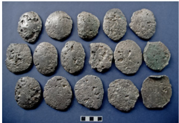
Fig. 2. General view of the hoards: Recouso (1 earring kept at the Museo Provincial de Lugo not included) (above); and Calvos de Randín (1 ingot not included) (below).

whereabouts of all these is currently unknown. The discovery of the hoard was initially announced in the press and in talks given by the Galician nationalist priest and intellectual, Xesús Carro García. Carré Aldao was the first author to provide a minimally detailed description and two pictures of the assemblage in a volume without a publication date (although it came out in the 1920s) (Carré Aldao s/d: 655-659). Later, Carro Otero (1996: 27), Carro García's nephew, contradicted what had previously been published, stating that the ingots came from the second find and not the first. In any case, their link to the rest of the preserved finds is not in question.