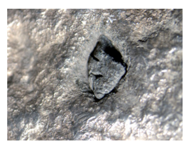
Fig. 5. Optical microscope image of one of the samples in the Calvos de Randín ingot (nº 3831) before its extraction.

The Calvos de Randín sample and the two from Recouso were sent for dating to Beta Analytic at different times. The analyses were carried out with AMS, using acid/alkali/acid as the pre-treatment