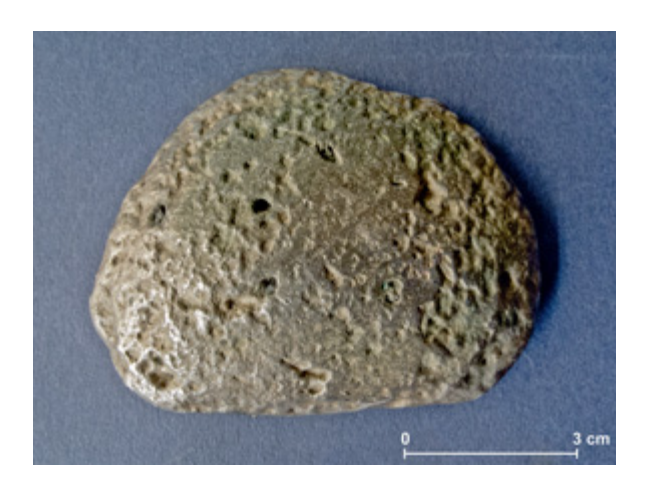
Fig. 4. Plano-convex ingot from Calvos de Randín (nº 3831).

The other dated object is a plano-convex ingot from the Calvos de Randín (Ourense) hoard, which was discovered by chance in 1962 and consists of 17 similar objects preserved inside a pottery vessel (6). According to our research, which is in the process of being published, the find spot probably corresponds to the interior of the hillfort of Outeiro da Cerca, which is consistent with the identification of the remains of a circular construction and pottery sherds at the time of the find (Lorenzo 1970)(7). Following their recovery by the authorities, the finds were taken to the Archaeological Museum of Ourense. The sample was taken from the object with inventory number 3831 (Fig. 4), corresponding to number 3 in Lorenzo's article (Lorenzo 1970: 230-231).